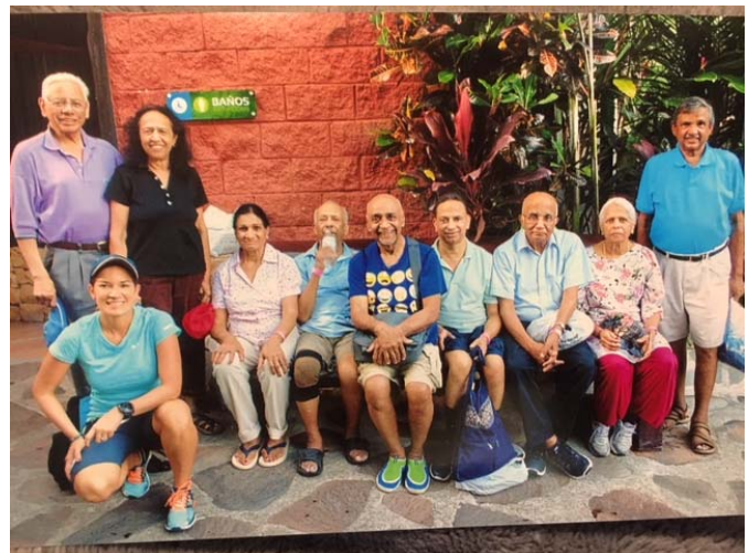
Sankethi Adventurers plus their tour guide, bottom left

All of us left individually or in small groups for San Jose, Costa Rica on February 20 2017 to spend a week on a Caravan bus tour of Costa Rica. We stayed at different hotels for six nights and had vegetarian food which was good to tolerable. During our trip, we saw a coffee plantation and processing, and took a river canal cruise where we could experience local wildlife including birds, tortoise, alligators, monkeys and herons in their natural habitat. We also saw 2 volcanic craters up close (not active, of course!) and walked through a natural rain forest crossing rope bridges and paths uphill and downhill. One of the hotels that we stayed at was located very close to Arenal, an active volcano, and we could clearly see the volcano spewing out steam from two of its peaks. Some of us had fun Zip lining from tree to tree with instructors. One day all of us had refreshing, water fun in the hot springs filled by water coming from the volcano. Some days our group of 10 celebrated with our own Sankethi snacks and drinks. We spent two days at the Pacific Beach Hotel for rest and relaxation.